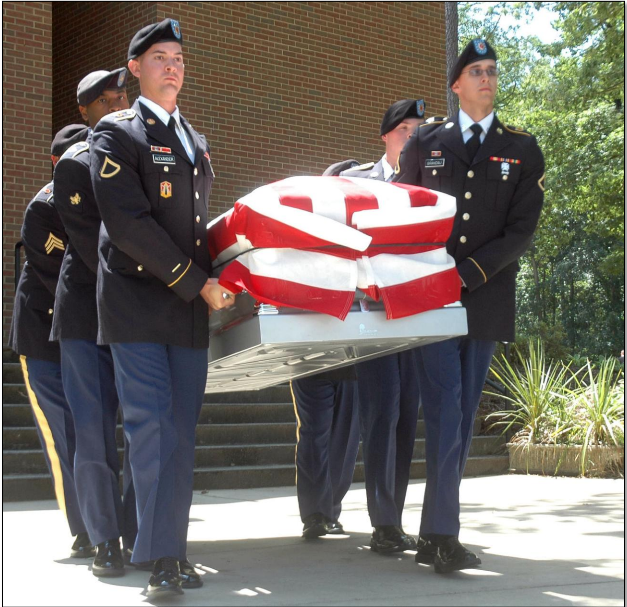
Soldiers from Ft. Sill, Oklahoma served as the Funeral Honor Guard