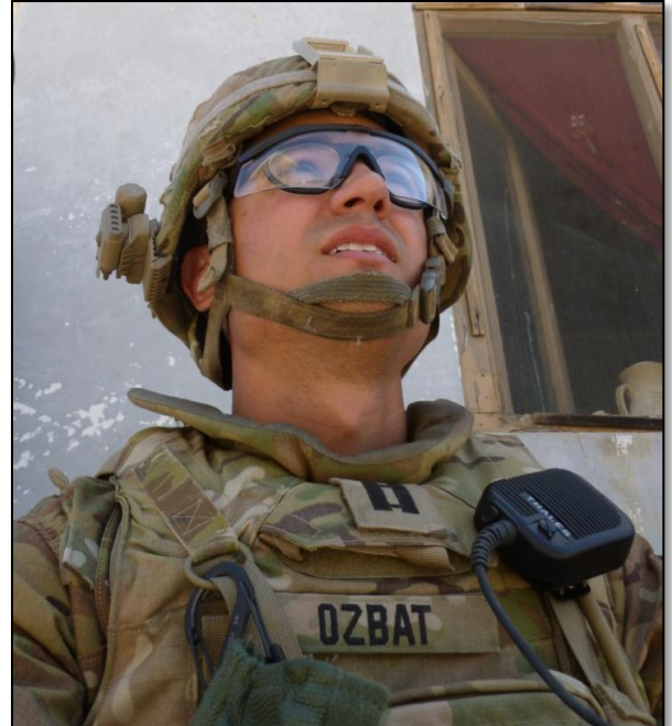
Above and below: Scenes from Afghanistan