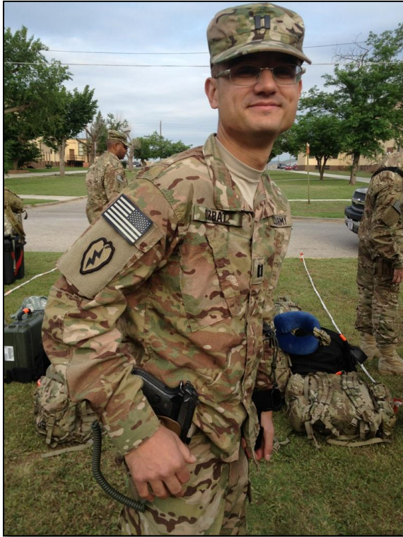
Below: Day of Departure for Afghanistan