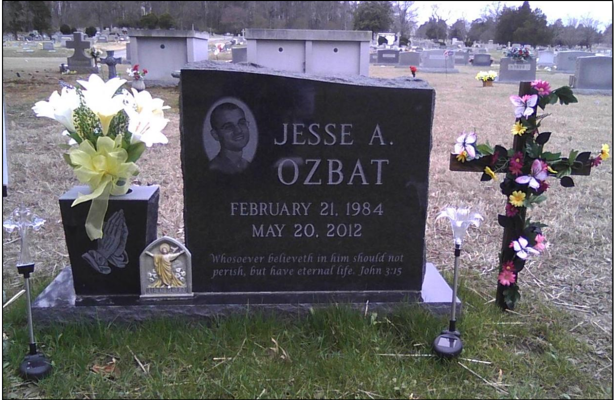
Final Resting Place