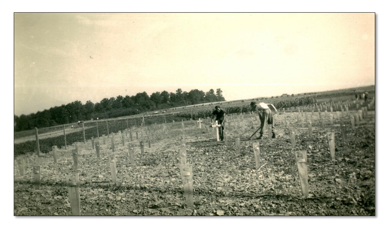
Above: Men erecting a cross at Jack's grave to replace the simple board marker.