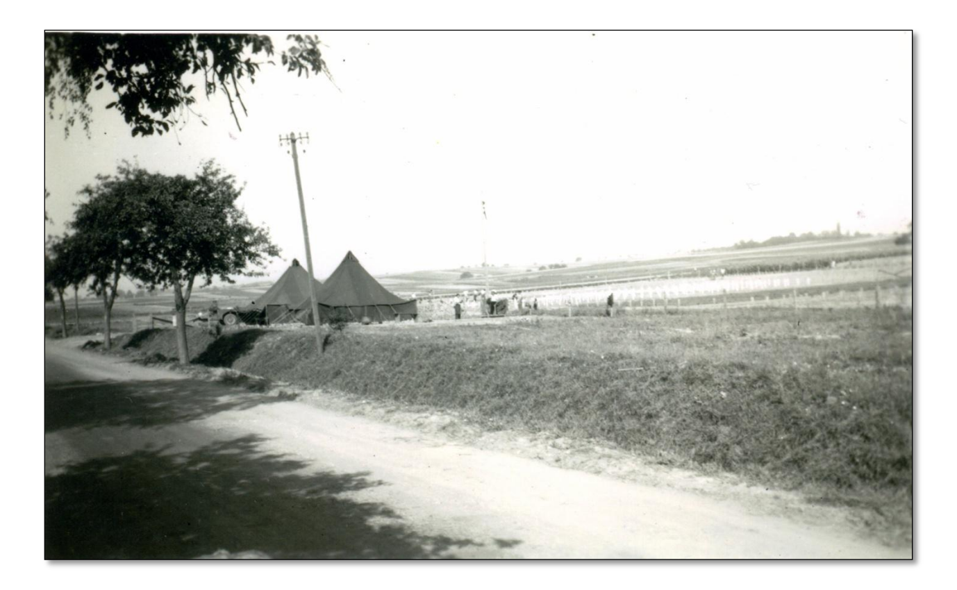
Above and Below: Hochfelden, France US Military Cemetery